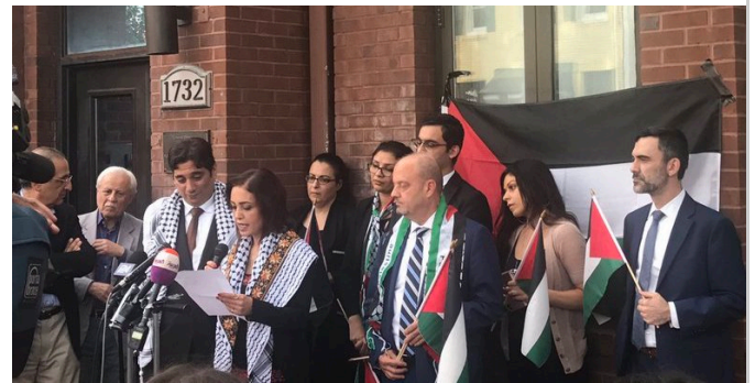
CMEP staff attended the closure of the PLO Mission in Washington D.C.